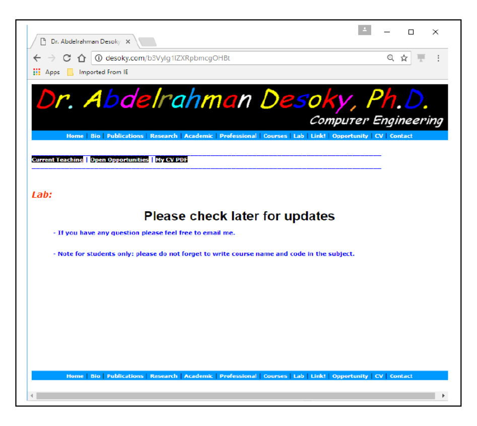
Figure 3: An actual example of URL-Cover. The message is not concealed in the web page content, but it is embedded in the URL.

and he is aware of URL-Stega as a public methodology. However, he does not know the actual URL-Stega configuration that the sender and recipient employed for their covert communication.