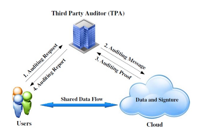
Figure 1: System model of public auditing mechanism