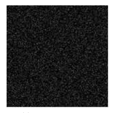
(a) Original watermark

where S denotes number of matching pixel values and D denotes number of different pixel values.