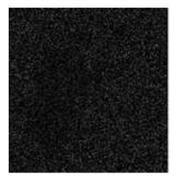
(b) Extracted watermark

In the proposed scheme, similarity ratio evaluated between extracted and calculated watermark is 0.8496 which indicates that the number of matching pixels are high and hence authenticity is preserved. The simulation results of previous Method [6] and the proposed one are exposed in Table 1.